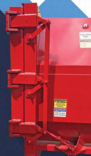
"LeakTight" Sealed Gate