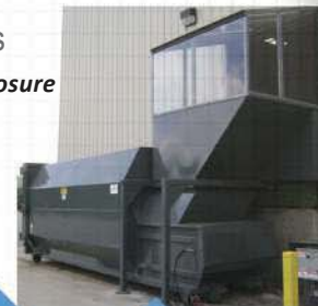
Full Enclosure SC Compactor Installation