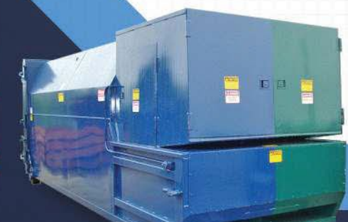
Special Dual Purpose Self-Contained Compactor