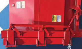
"LeakTight" Sealed Gate