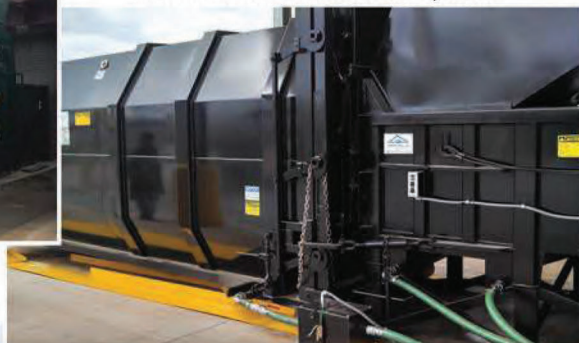
Custom "Air Feed" Compactor Installation