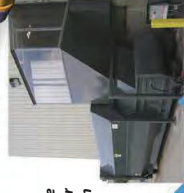
Full Enclosure SC Compactor Installation