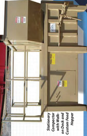
Stationary Compactor with Walk-on Deck and Custom Feed Hopper