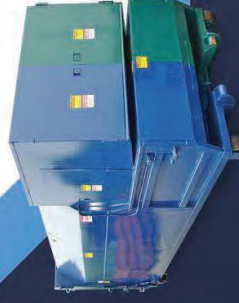
Special Dual Purpose Self-Contained Compactor