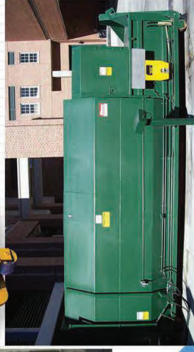
Self-contained Compactor Installation with Doghouse Hopper and Cart Tipper