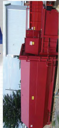
Full Enclosure Stationary Compactor Installation