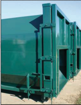
Receiver Door Latches