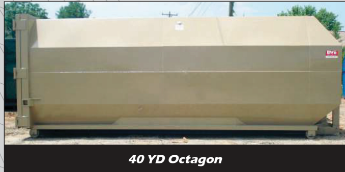
40 YD Octagon