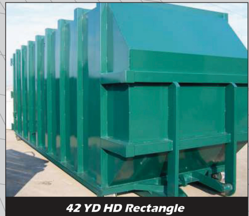
42 YD HD Rectangle