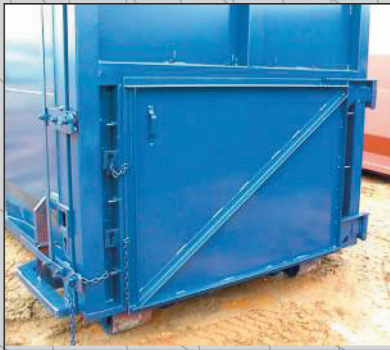
Receiver Travel Door