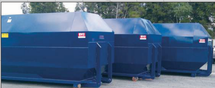
Receivers Ready For Deployment